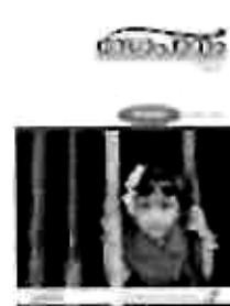
Sopanam Issue No. 1 (May 2005)