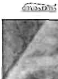
Sopanam Issue No. 3 (October 2006)

Sopanam is a magazine published by the Information Kerala Mission for creating public relations on the activities of the Organisation. So far three issues of the Sopanam were published. In 2006, the Annual Edition of the Magazine was published on October 2006.