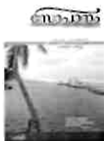
Sopanam Issue No. 2 (July 2005)